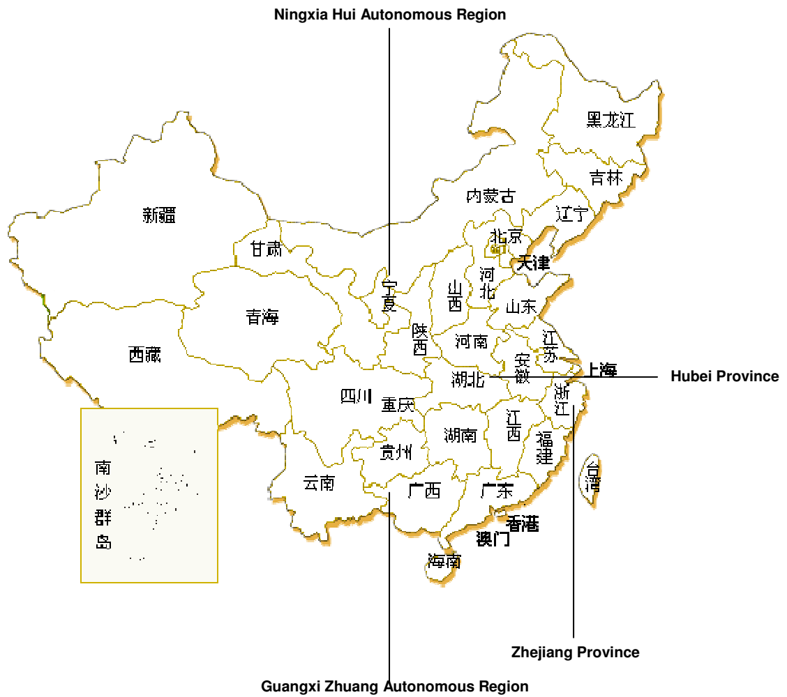
Pre-suggested Pilot Provinces by the Formulation